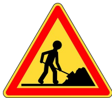
RETAINING WALL - RUE DE LA GARENNE

This invitation followed the municipal council meeting of June 6. Having been informed of the promise of a long lease with the company TSE, with a view to the establishment of a photovoltaic park, the Municipal Council, favourable to the project, unanimously decided to adjourn the deliberation and to organize an information meeting for the population. We will present the project in more detail in a future communication..