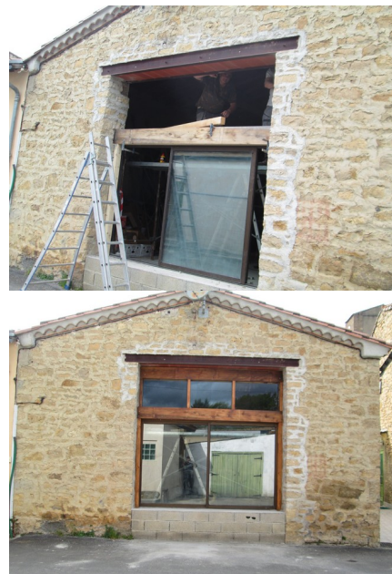
THE ANNEX OF THE ASSOCIATION HALL IS TRANSFORMED...

A bay window was installed by the municipal employees to close the room which will be used as a storage place for the Festival Committee (various